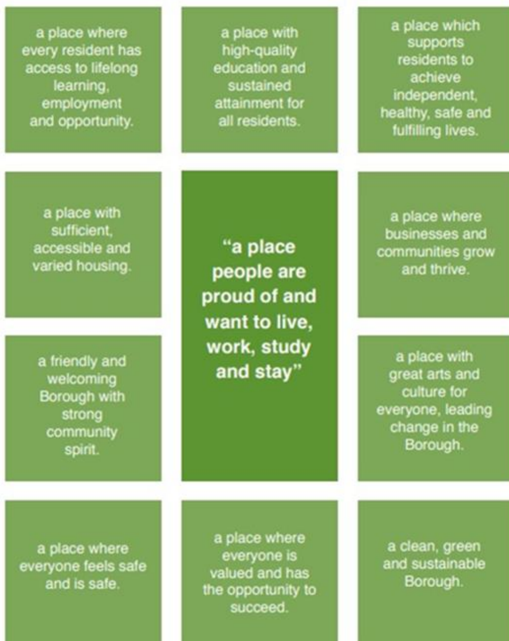
Figure 1: Extract from the Borough Manifesto: Long-term Vision for Barking & Dagenham

1.6 It should be noted that preparation of the evidence base that informs and supports the Local Plan is ongoing. This is expected for this stage in the process, and policies will be added and refined as appropriate, to reflect evidence findings (as well as public consultation responses and Duty to Co-operate discussions).